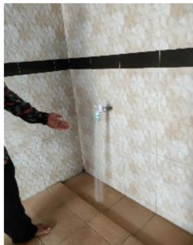
Figure 2. The tap splash shower system

The observation result showed that the water tap height was 72 cm, therefore, the elderly have to bend by 90°. Also, there was no handrails, seats and footrests, while the distance between the ablution and the prayer places was 5 meters.